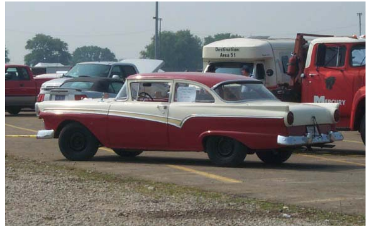
This nice Custom 300 with good body was for sale at $3500.