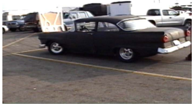
My own '57 sat in the pits in this condition most of the weekend, victim of a toasted starter.