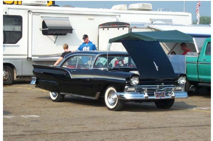
Unidentified, beautiful black Fairlane 500 hardtop.