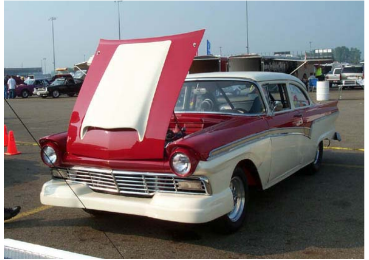
Dave Fuzsner has a cool old Y-block powered '57 Custom 300.