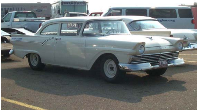
Dunc's cool Custom 300, converted to 70A trim.