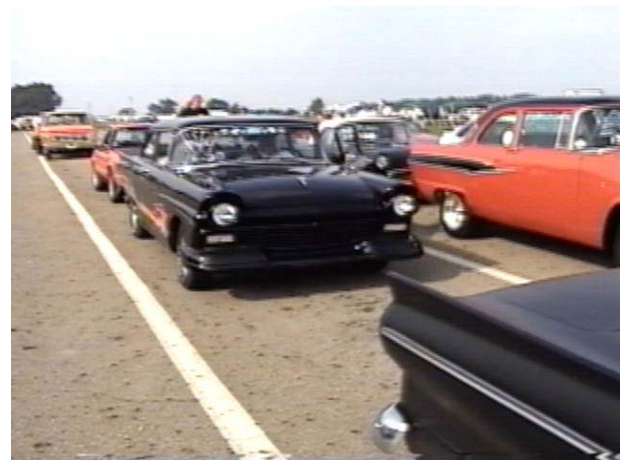
Waiting for another turn at the 1320.