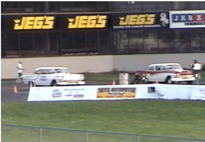
Feistritz and Fuzsner face off in the Y-Block Shootout.