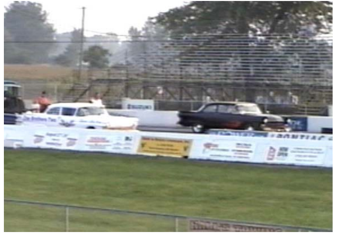
Joe and Allan face off in the final round of the '57 Ford Shootout.