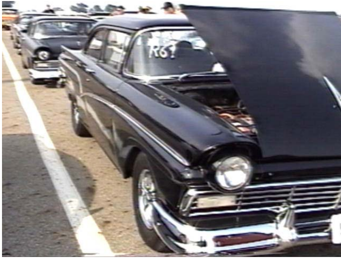
This lineup in the staging lanes was impressive.