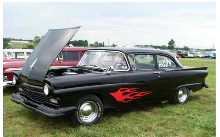
Allan White built his Custom from the ground up with 351 W power, and N20 to boot.