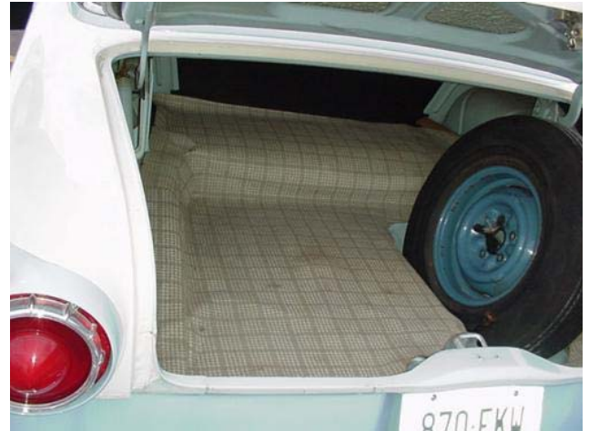
Check out the original trunk mat and spare.